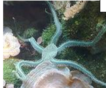
Green brittle star ( Ophiarachna sp. )