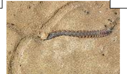
Common Clam Worm