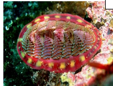
Tonicella lineata (Lined Chiton)