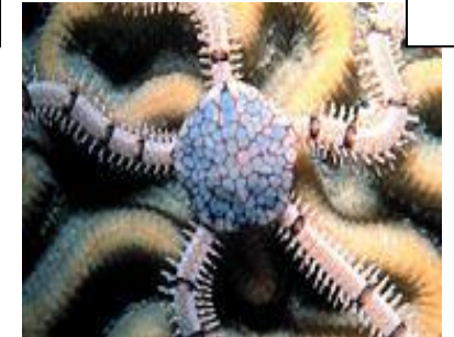
reticulated brittle star ( Ophionereis reticulata )