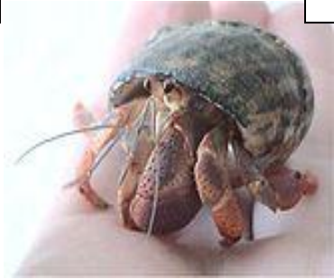
Coenobita clypeatus (Caribbean hermit crab)