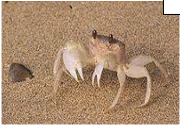
Common Ghost Crab