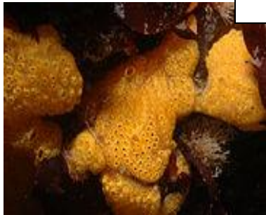
Orange Sheath Tunicate