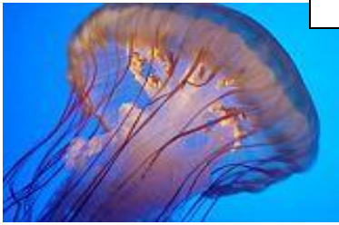
Stinging Sea Nettle