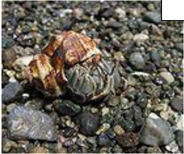
Coenobita compressus (Ecuadorian hermit crab)

Most species of hermit crabs have long soft abdomens which are protected from predators by the adaptation of carrying around a salvaged empty seashell, into which the whole crab's body can retract. Most frequently hermit crabs utilize the shells of sea snails, marine gastropod mollusks. The tip of the