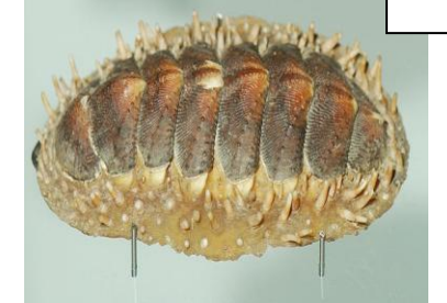
Acanthopleura (Spiny Chiton)

Chitons live attached to rocks in shallow water. The Chiton feeds mainly on plants of the sea, removing the plant with its radula (rough tongue). They glide using a massive foot. Their back is covered with eight heavy armor-like dorsal plates.