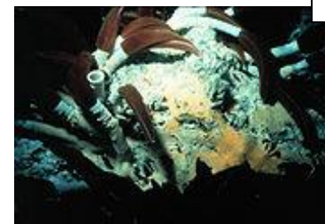
Giant tube worm

Canaliculipalata. Other groups also called tube worms include members of the phylum Phoronida (horseshoe worms).