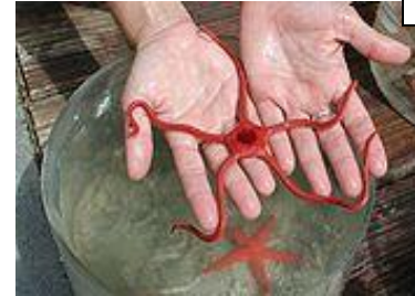
Giant red brittlestar Ophioderma sp.

Brittle stars are echinoderms, closely related to starfish. They crawl across the sea-floor using their flexible arms as "legs" for locomotion. The Brittle star generally have five long slender, whip-like arms which may reach up to 60 centimeters (2 feet) in length on the largest