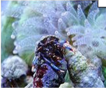
Clibanarius tricolor (Blue-legged Hermit Crab)