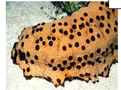
Three-Rowed Sea Cucumber