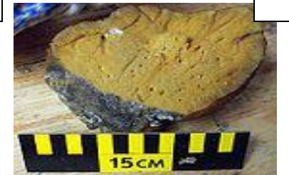
Cloud Sponge Fire Sponge

The sponges or poriferans (from Latin porus "pore" and ferre "to bear") are animals of the phylum Porifera. Porifera translates to "Pore-bearer". They are primitive, sessile, mostly marine, water dwelling filter feeders that pump water through their bodies to filter out particles of food matter. Sponges represent the simplest of animals. With no true tissues (parazoa), they lack muscles, nerves, and internal organs. There are over 5,000 modern species of sponges known, and they can be found attached to surfaces anywhere down to 29,000 feet.