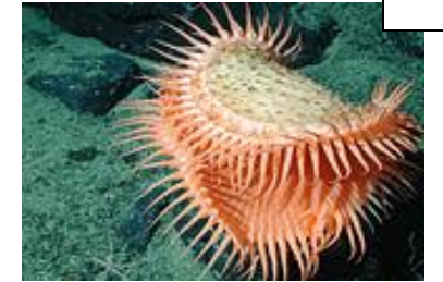
Family Hormathiidae (Fly-trap Anemone)