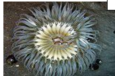
Anthopleura sola (Sunburst Anemone)

Sea anemones are a group of water dwelling, predatory animals of the order Actiniaria; they are named after the anemone, a terrestrial flower. As cnidarians, sea anemones are closely related to corals, jellyfish, tube-dwelling anemones and Hydra.