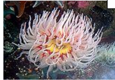
Urticina piscivora (Fish-eating anemone)