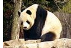
Giant Panda China

A person who illegally hunts an animal in order to kill it.