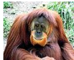
Orangutan Borneo and Sumatra