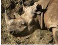
Black Rhinoceros Africa