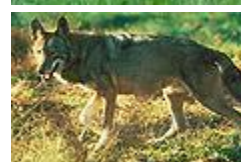
Red Wolf North America