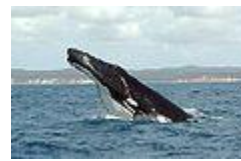
Humpback Whale Oceans