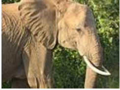
African Elephant Africa