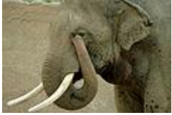
Asian Elephant Southern Asia