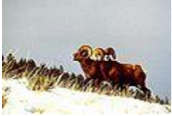
Bighorn Sheep Western US & Canada