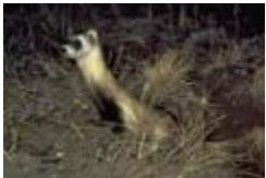
Black-footed Ferret North America