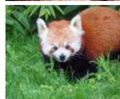
Red Panda Himalayas (Nepal and China)